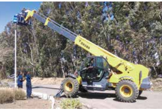
XCMG telescopic handlers help municipal constructions in Africa