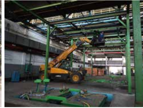
XCMG Telescopic Handlers Build Sugar Refinery in Ethiopia